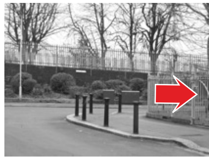
and then turn right into Elmore Road.