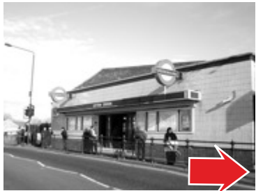
Leyton Tube Station (Central Line), buses 58, 69, 97, 158. Turn left out of the station.