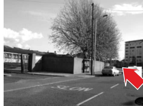
Pass the Hospital and keep left at the next junction, still on Langthorne Road.