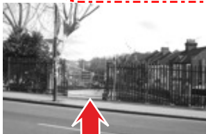
Go down the steps to Goodall Road (or keep to the main road and then turn left into Goodall Road)