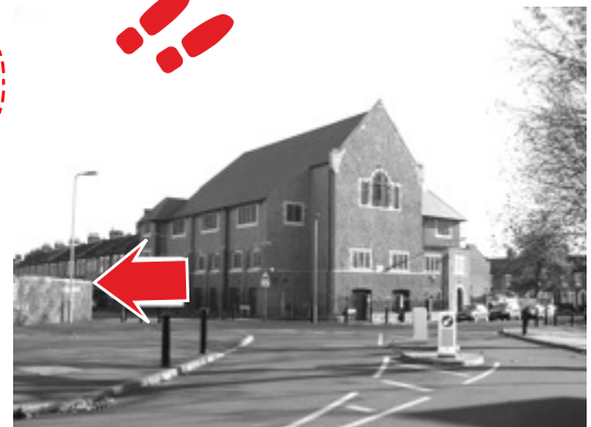
At the junction turn left along Langthorne Road beside the New Testament (formerly the Fetter Lane Congregational) Church