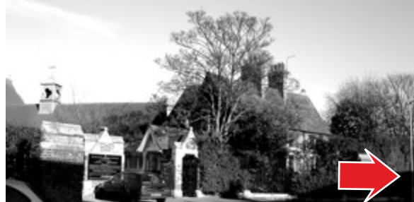
Pass St Patrick's Cemetery (where are buried the last victim of Jack the Ripper and nuns commemorated in a poem of Gerard Manley Hopkins)