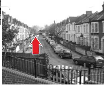
Walk along Goodall Road to the end