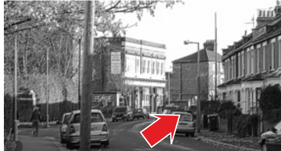
Pass the Birkbeck Tavern (a traditional pub) and keep straight ahead at the crossroads.