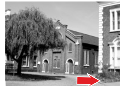
Langthorne Road becomes Thorne Close and goes past healthcare buildings and the Workhouse Chapel