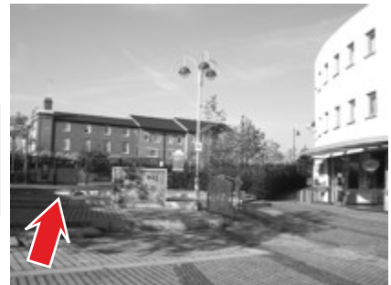
Walk around Langthorne Park