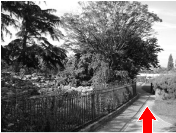
past the pond