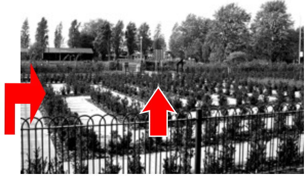
past the maze

At the end of Coronation Gardens is Oliver Road. Either walk back through the Gardens to Leyton High Road, or take Walk G to Ruckholt Road (see separate leaflet)