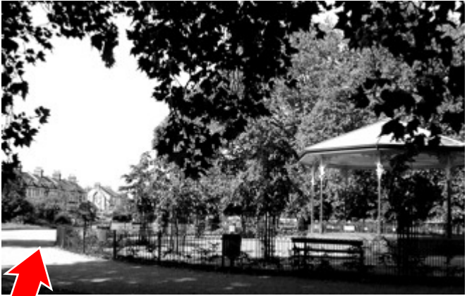
past the bandstand

part of the Leyton Loops series of short walks