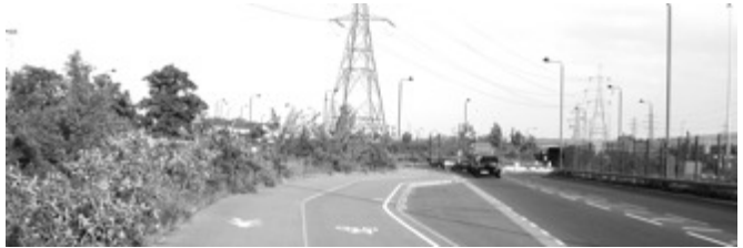
Follow the whole length of Orient Way past the Gateway Road turning to a roundabout