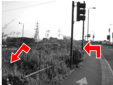
Or cross Ruckholt Road