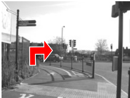
< Ruckholt Road (bus W15) >