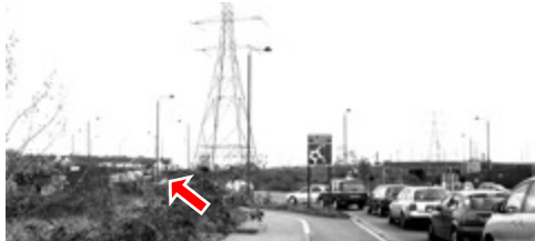
At the roundabout fork left