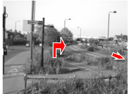
See the separate leaflet for Walk F to Leyton Central Line station