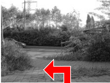
Near a footbridge, turn left through a gap in the bushes into Orient Way, and turn left again