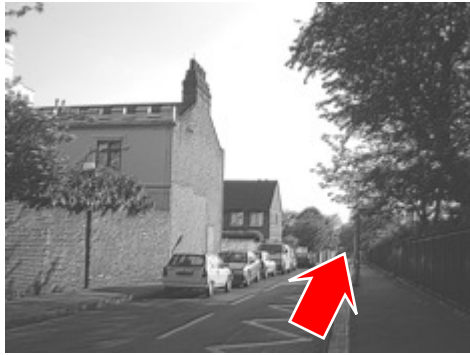
Cross over the Dagenham Brook, past the Eton Manor Lodge, along a tree-lined avenue between football pitches, to the end