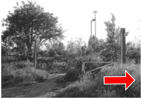
Turn right onto a footpath (signposted)