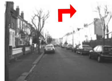
Walk back and then carry on along Thornhill Road until you reach Oliver Road