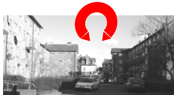
Turn around before you reach the blocks of flats