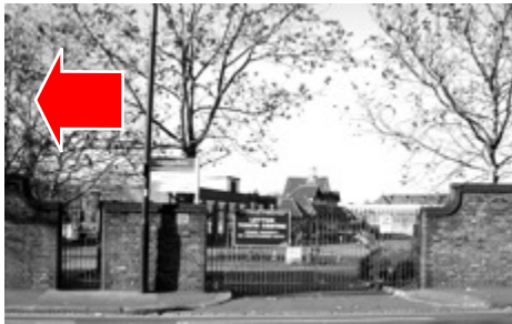
Looking at the entrance to Leyton Youth Centre, turn left.

Buses 69 and 97 pass Leyton Youth Centre.