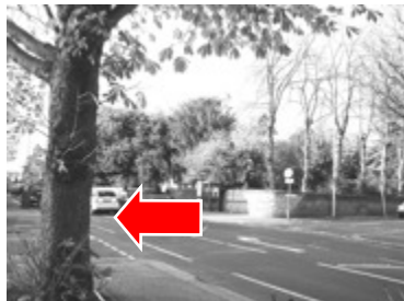
Turn left into Rosedene Terrace