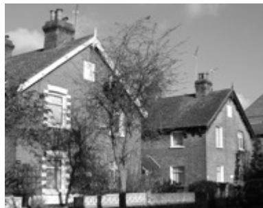
Take the 2nd turning on the left (into Thornhill Road).