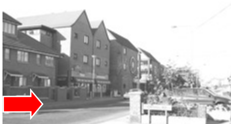
Turn right into Oliver Road