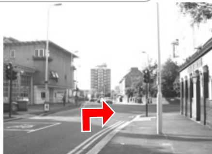
Turn right at the Oliver Twist pub