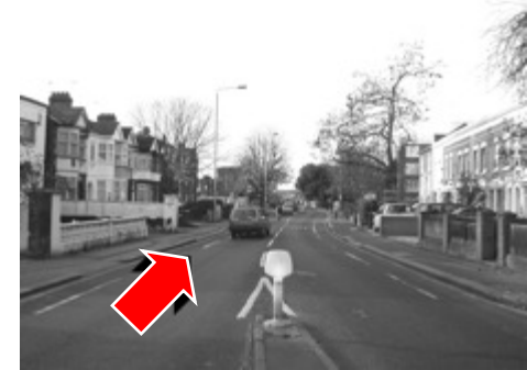
At the junction, keep straight on.