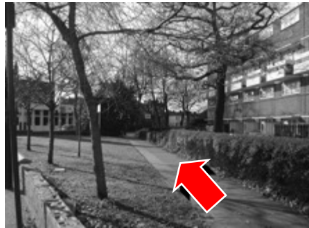
Fork right alongside a block of flats and keep right into Church Road.